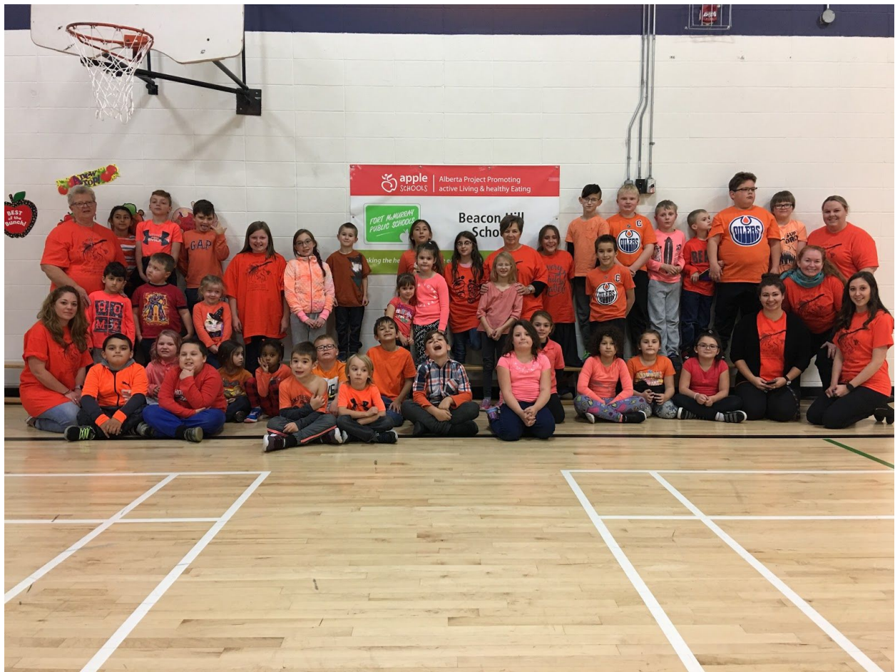
Orange Shirt Day