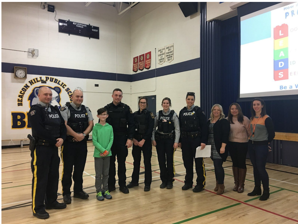
Our special guests at our WITS Assembly!