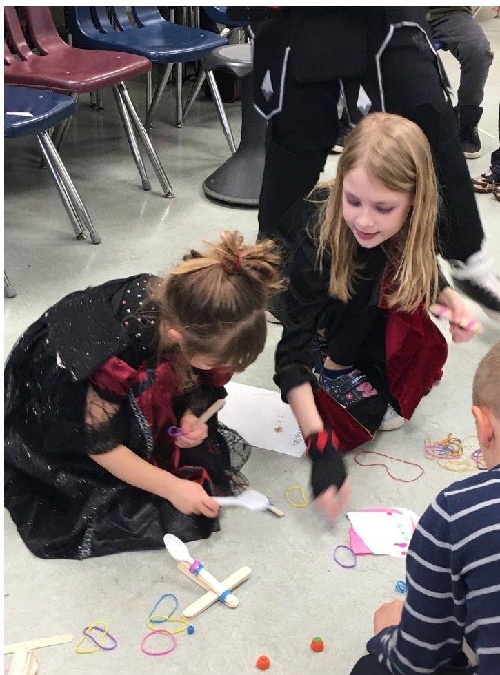
Halloween STEAM centers!