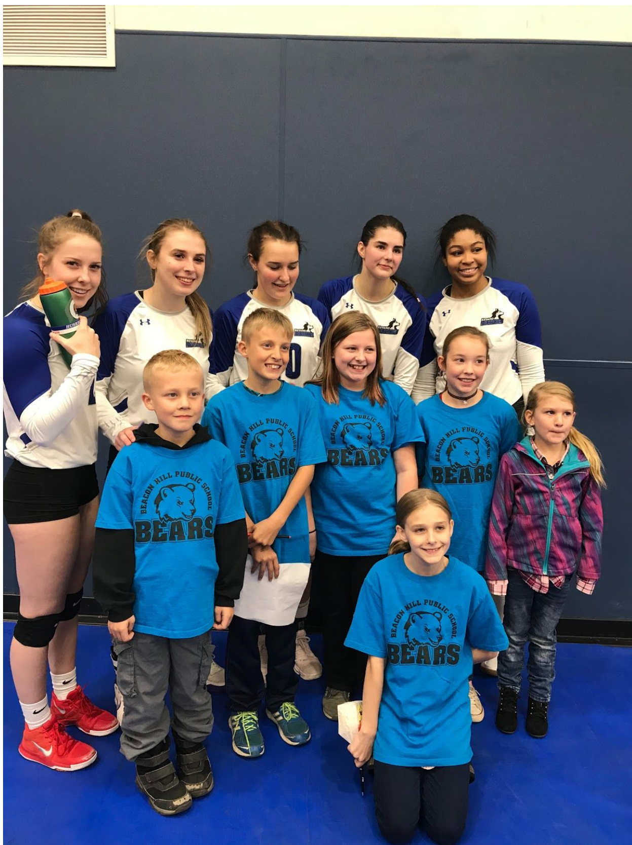
Members of our Gr 5 /6 volleyball team watched Keyano Huskies Season Opener!