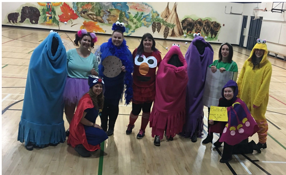
Halloween 2018- Sesame Street came to Beacon Hill School!